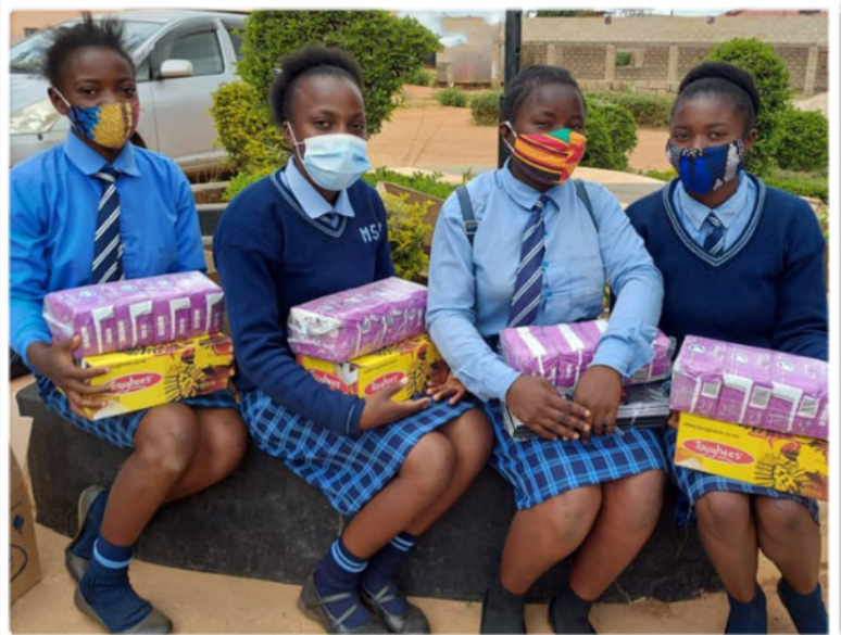
Four Scholarship Fund Recipients